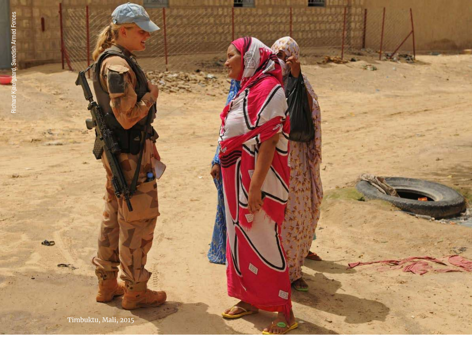
LIST OF TERMS