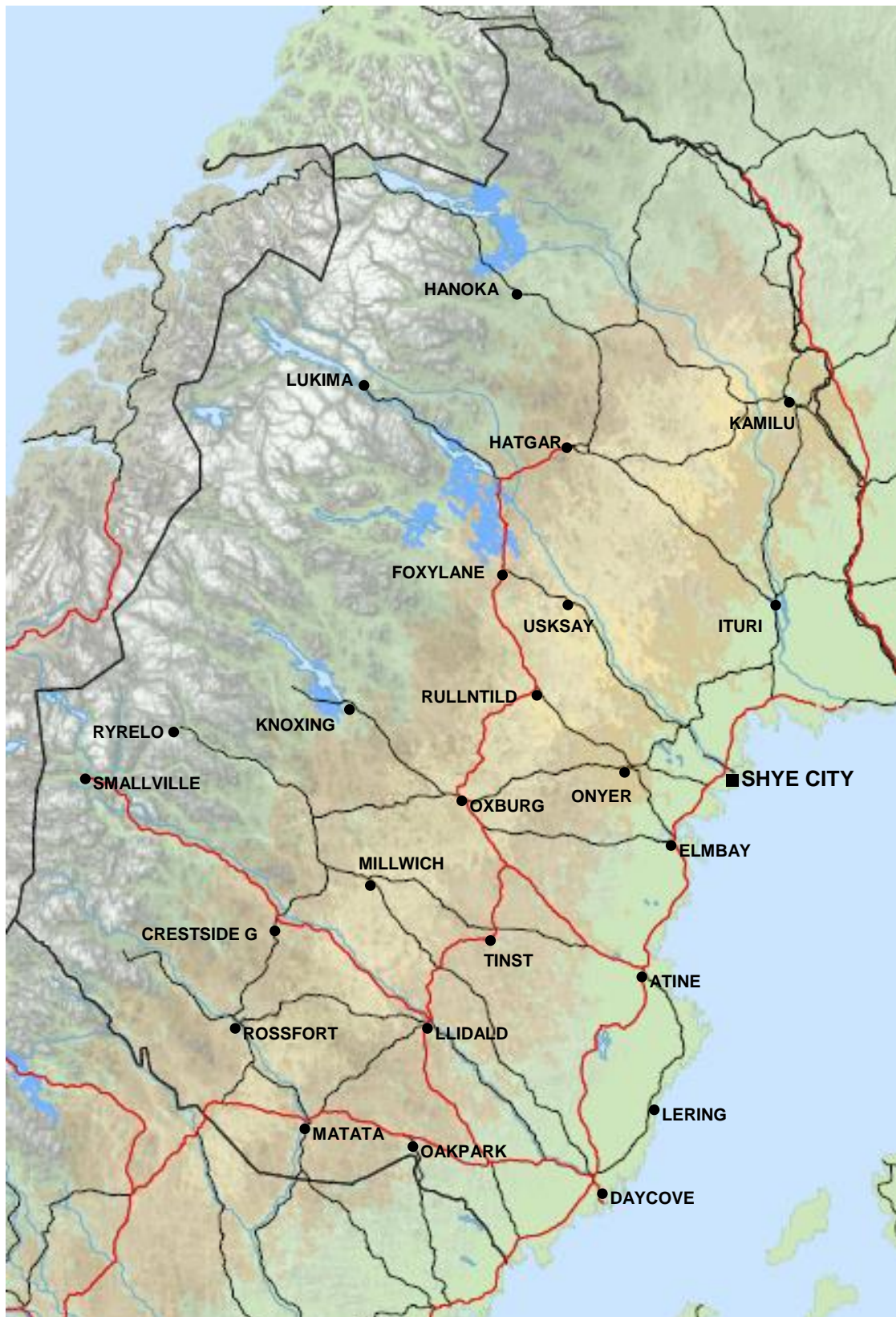
Figure 2- Map of Gothia